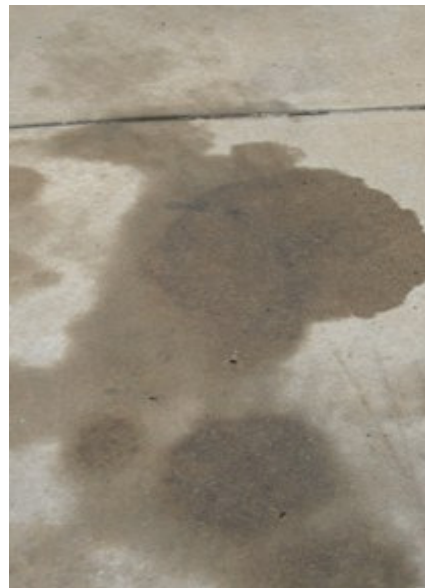
Before photo showing concrete driveway with large, deep oil stains

renewal application may be required to keep peak efficiency. Steam cleaning will kill some but not all bacteria. Again, a renewal application may be necessary if steam cleaning is required as part of the maintenance process. Store all containers in a cool, dry facility.